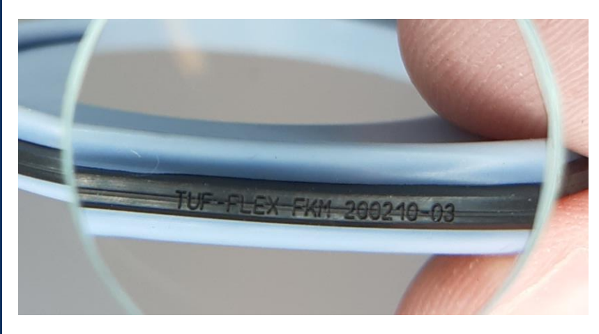
All Tuf-Flex<sup>®</sup> FKM gaskets from Rubber Fab are laser marked by default. The marking includes the lot number and the material name for full and easy traceability.

For further information please contact Rubber Fab.