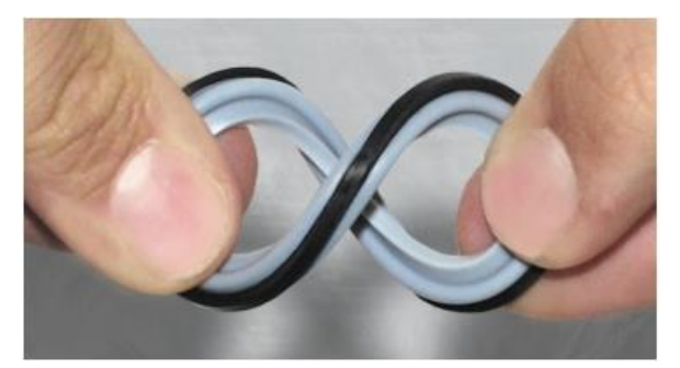
Tuf-Flex®provides high flexibility and adaptation to flanged equipment.